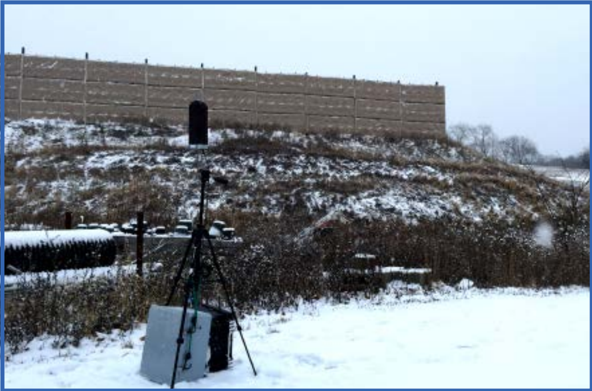
Trax Farms, PA 2015