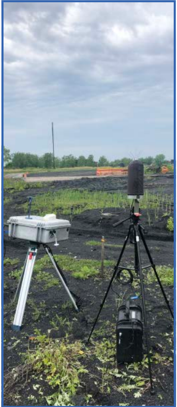
Tonawanda, NY 2021