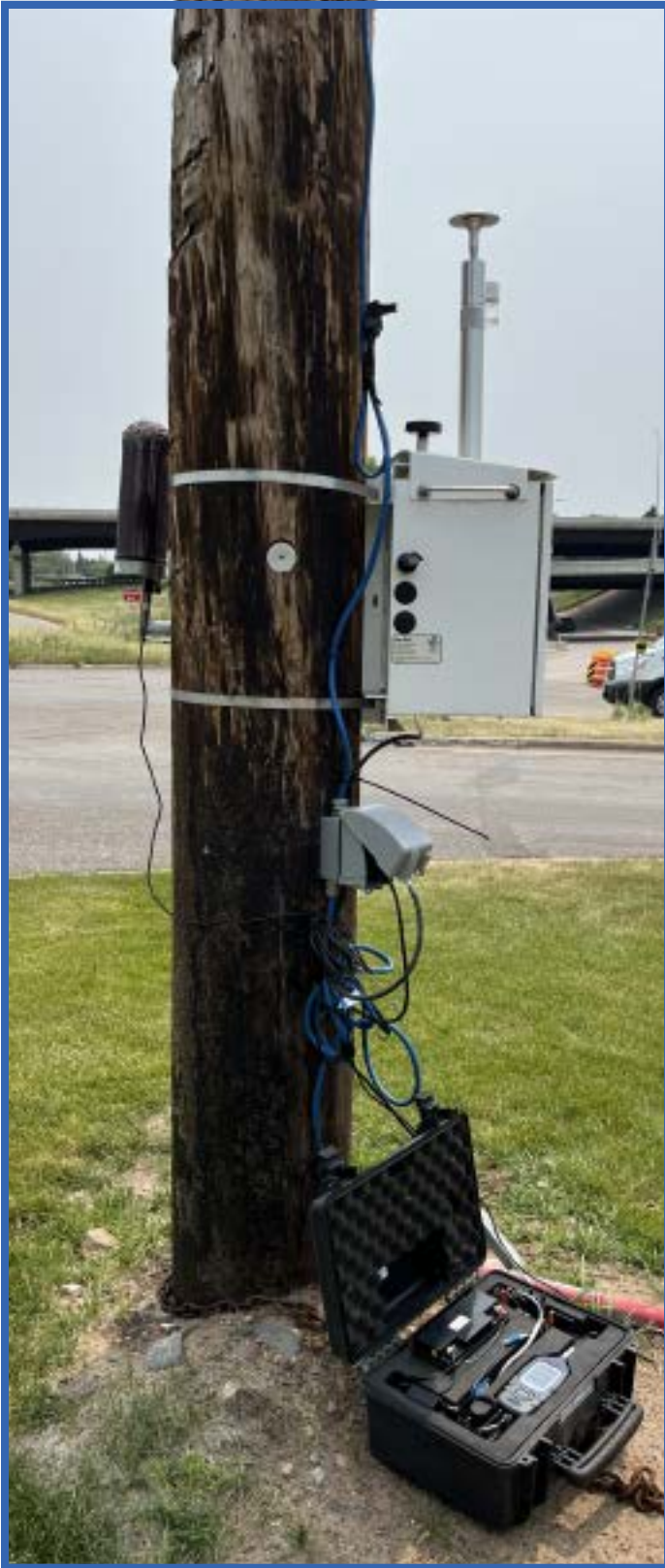
Etna, MN 2023