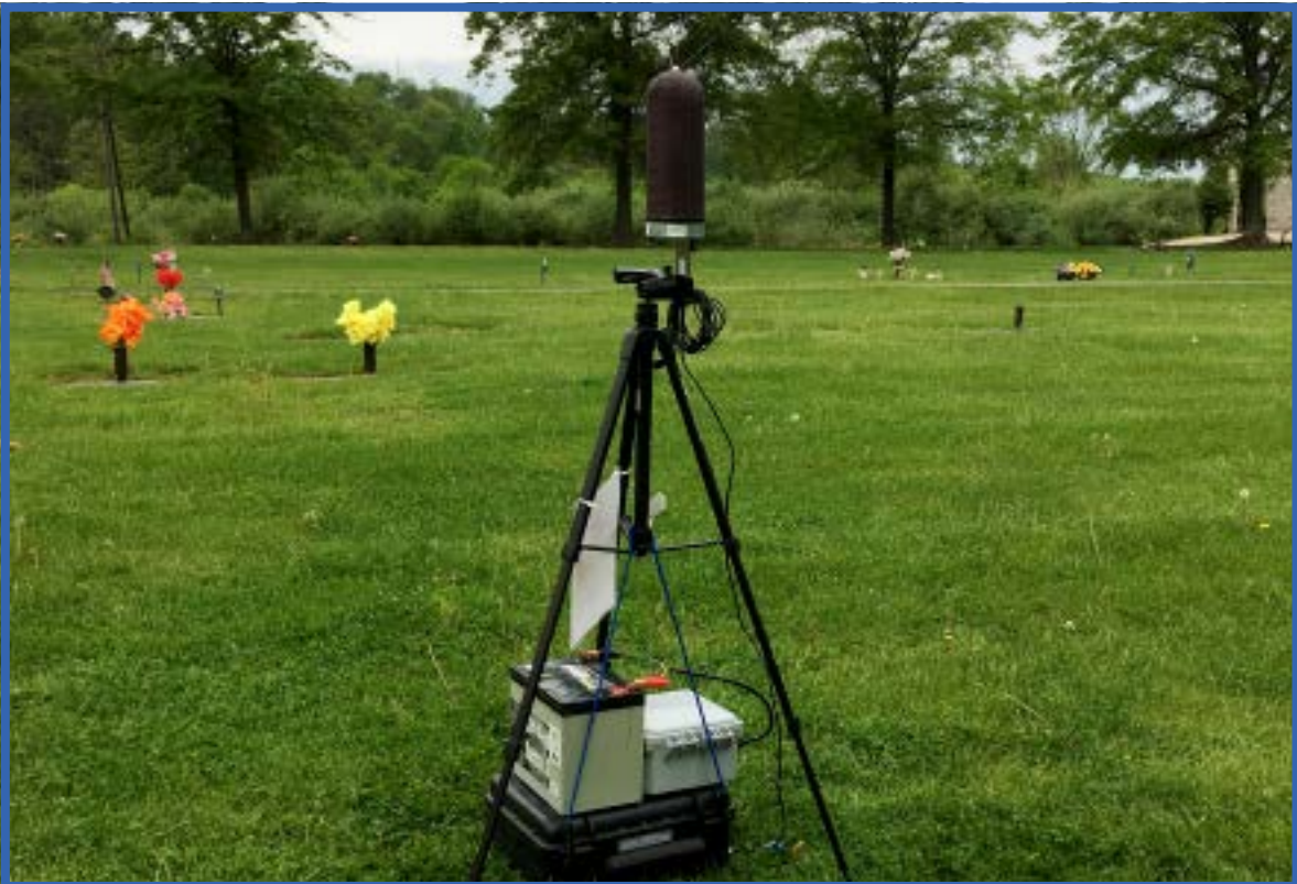
Dilles Bottom, OH 2017